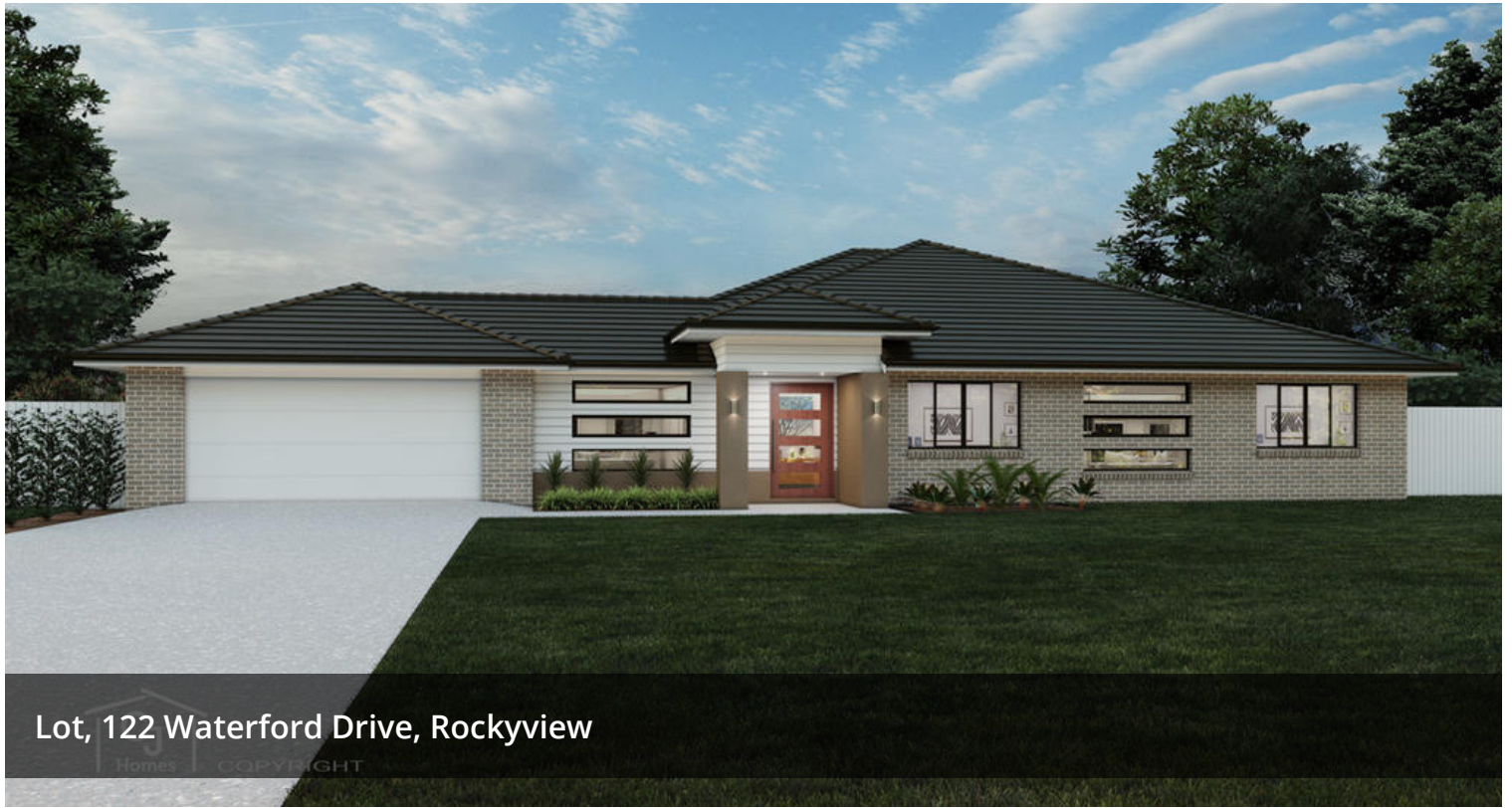
Lot, 122 Waterford Drive, Rockyview